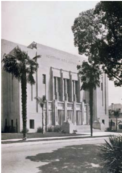
Scottish Rite Cathedral 1920, Pasadena, CA Some say erected 1925, but the book " Picturesque Pasadena " published in 1920 shows the Cathedral.