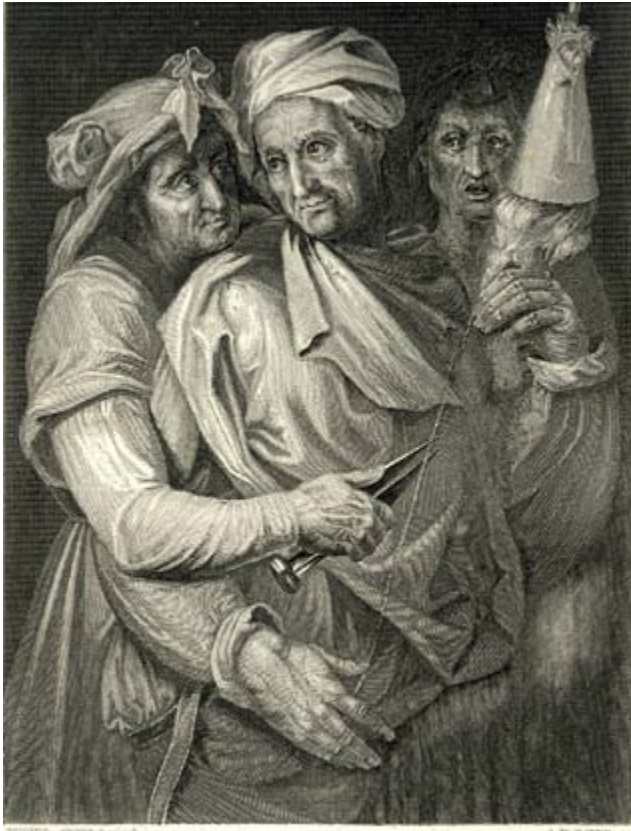
A scan of the etching of The Fates from the book: Pictorial History of the World's Great Nations, volume I - 1882 - C. M. Yonge